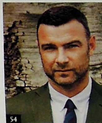
ON THE COVER Liev Schreiber portrays Ray Donovan as both charming and brutal.